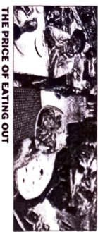
THE PRICE OF EATING OUT

New Delhi: The Delhi High Court on Tuesday asked the members of a restaurant to use the term 'staff contribution' for the amount they were claiming from their customers as a 'service charge'.